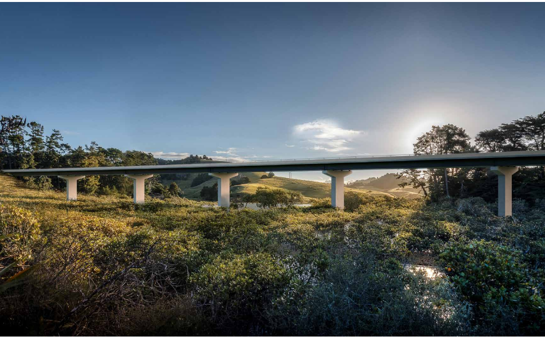
Artist's impression of the new Okahu viaduct