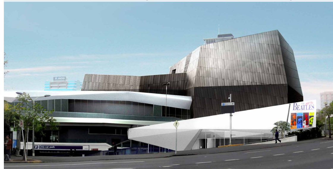
Artist's impression of Aotea Centre after the refurbishment with paladin