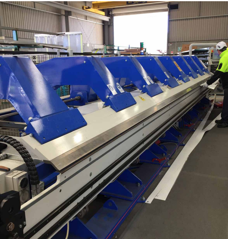
The SWI folder in use at Steel & Tube's Hornby facility